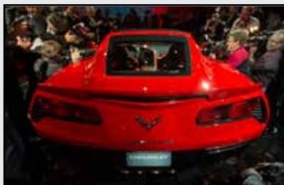
More Views of C7