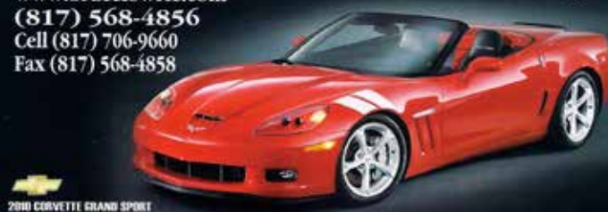
2010 CORVETTE GRAND SPORT