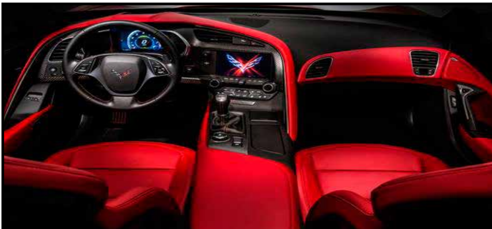
New Hot Look of C7 Interior