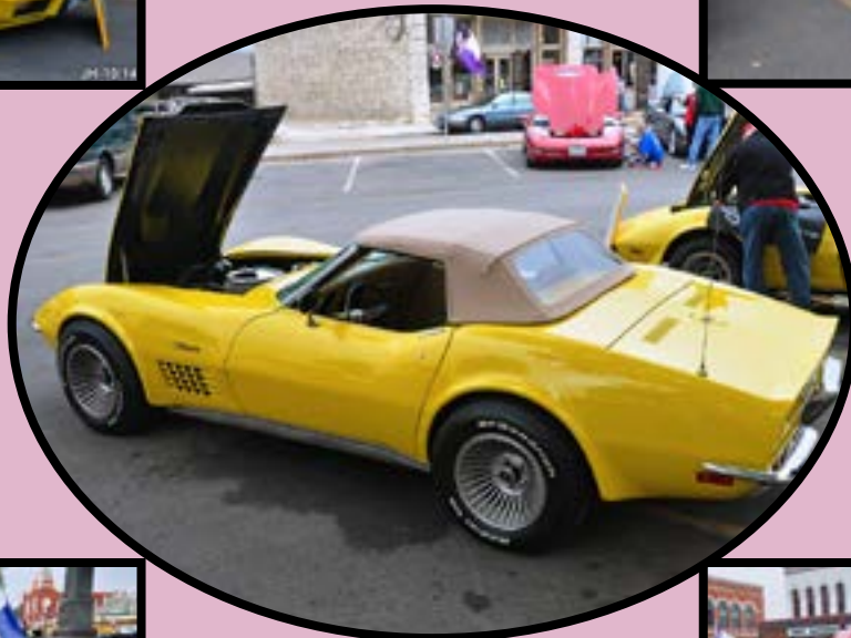
Carol's C3 Convertible