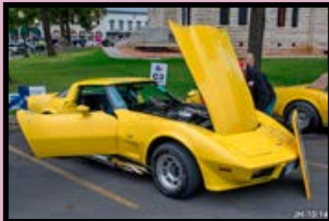
Bud & Ruth's C3 Coupe