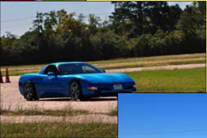
The Cowtown Competitors