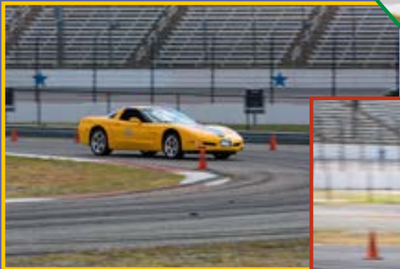
Raley in their C5 Coupe