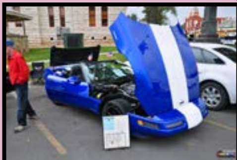
Tony's C4 Grand Sport