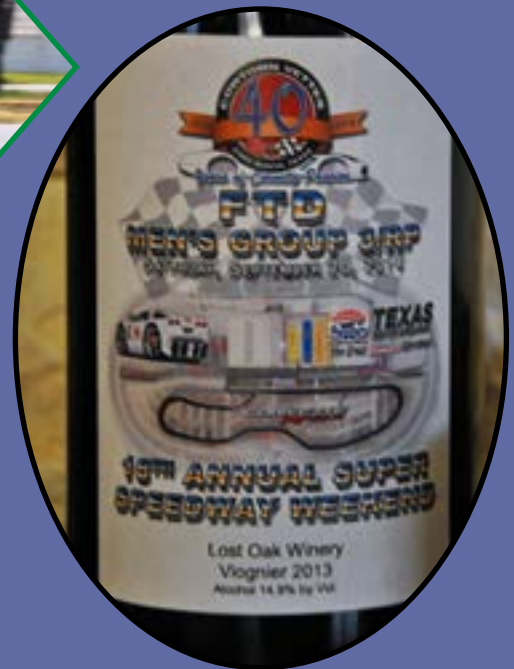
FTD Awards for Saturday