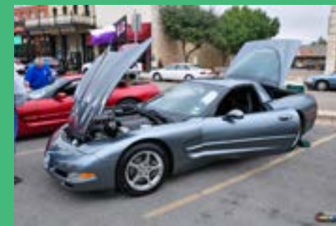
William & Mary's C5 Coupe