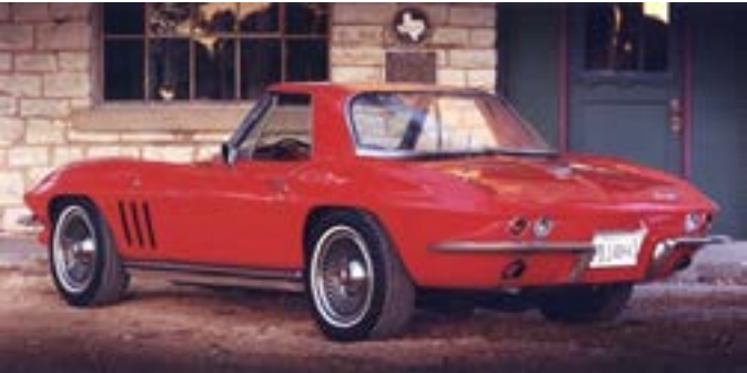
Fred & Donna Rosett's '65

Another of my favorite trivia questions involves the first time fuel injection was available on a Corvette. The answer can be found on the Corvette timeline on the same page as above. The 1957 Corvette offered optional fuel injection and the first ever 4 speed manual transmission. The "fuelies" have become one of the most sought out collectable Corvettes and they typically sell