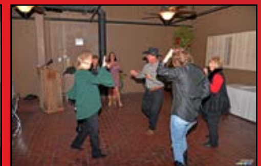
Plenty of time to scoot a boot after the awards