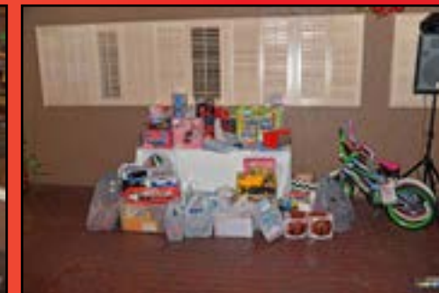
Toys for Tots Toy Drive