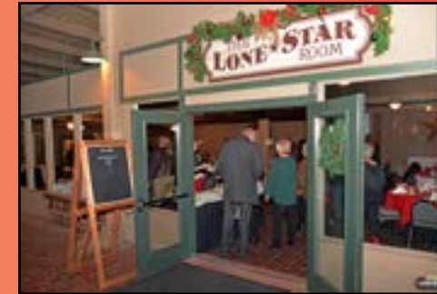
The Lone Star Room in the Fort Worth Stockyards