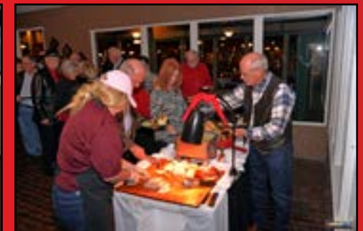
Great food catered by Risky's