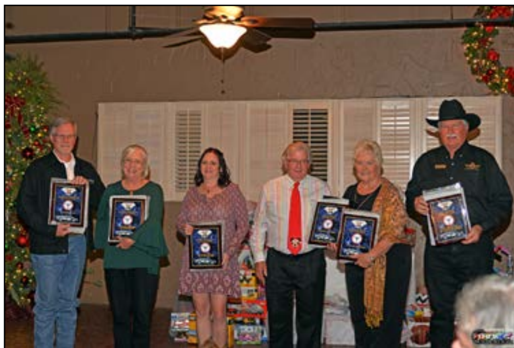
NCCC Top Individual Award Winners