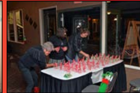
Homemade name tags and stands