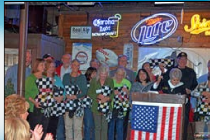
Gwynne presenting the 100%er Awards