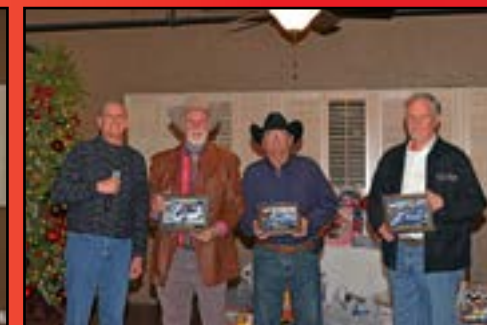
Car Show Competition Awards