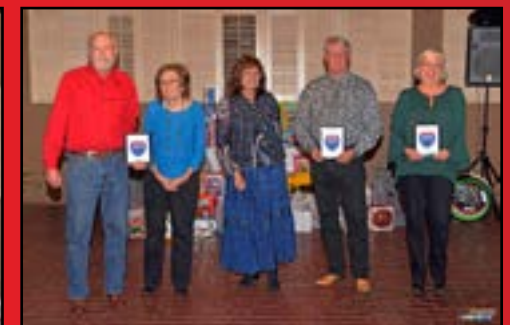
Cruiser Participation Awards