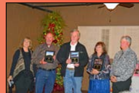
Cruiser Photo Award Winners