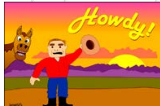
Cover photo - 2017 Regional Champions. Go Cowtown!