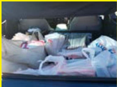
December 6th 2020 Fort Worth, Texas