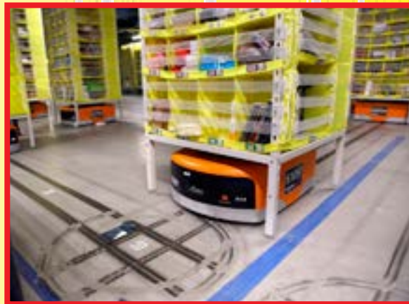
Amazon Tour ...cool little robots

Some Great Web pictures from 2020 Events to Remember: