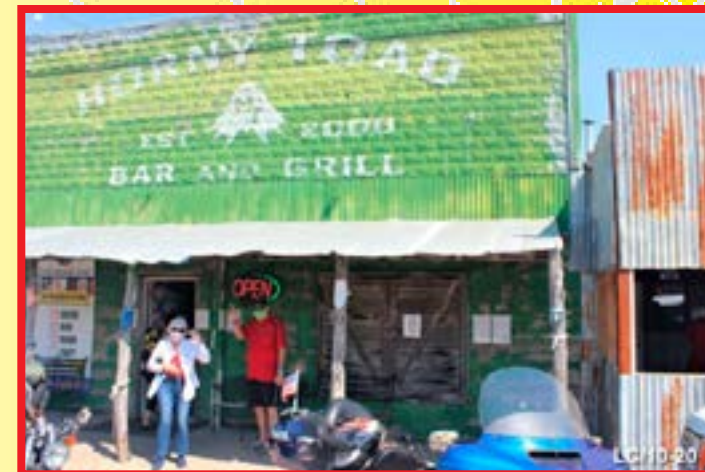
Cranfills Gap Cruise...Horny Toad