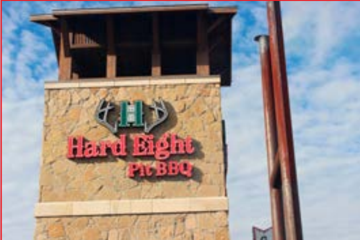
December 5th 2020 220 N. Burleson Blvd Burleson, TX 76028