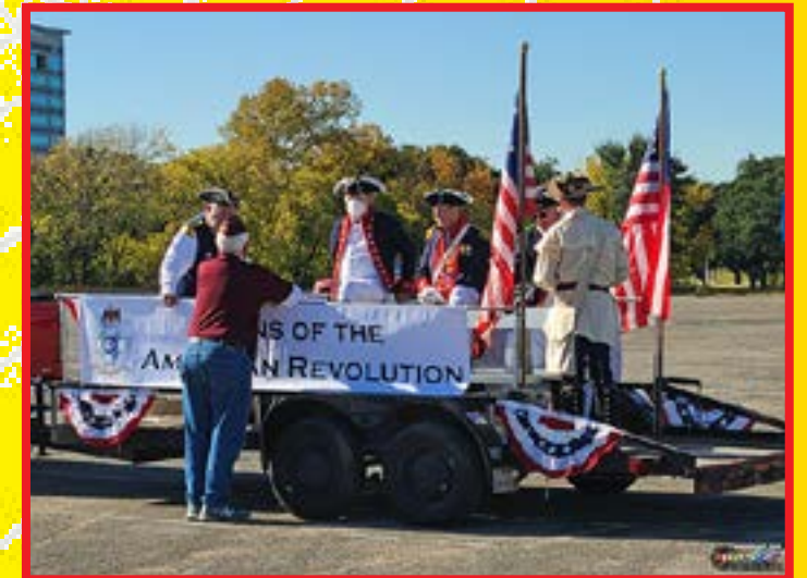
Veterans Day Parade