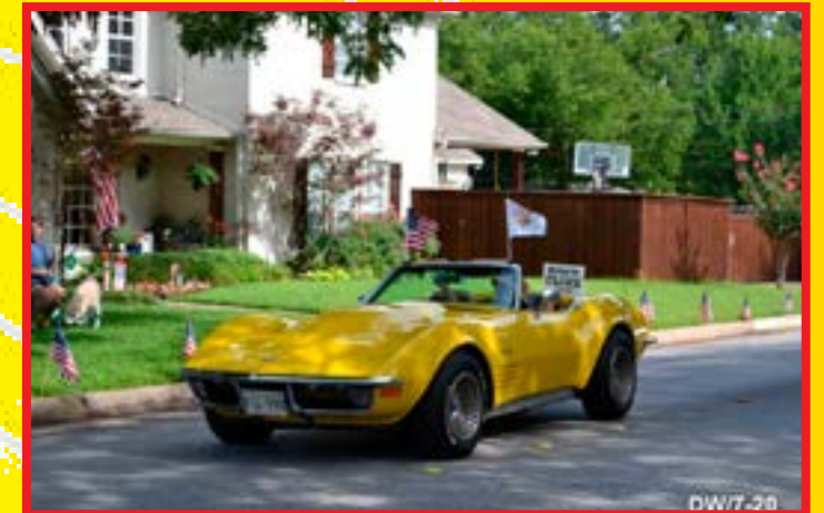
Fourth of July Parade