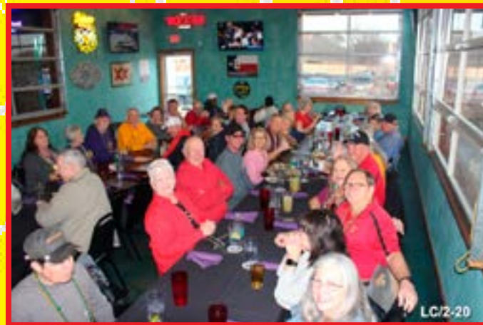
Mardi Gras Party...great food and fun