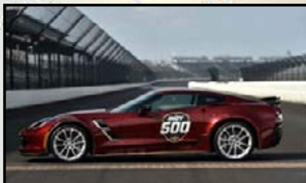
C7 Pace car

For the eighteenth time, a Corvette will lead the starting field to the green flag for the 105th running of the Indianapolis 500 presented by Gainbridge on May 30, 2021. This year a 2021 mid-engine Chevrolet Corvette Stingray hardtop convertible finished in Arctic White with yellow and gray accents will have the honor of pacing the thundering field of open-wheel race cars — the first time since 2008 that a convertible has been selected.