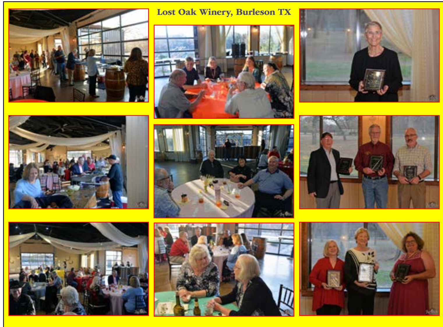
Lost Oak Winery, Burleson TX